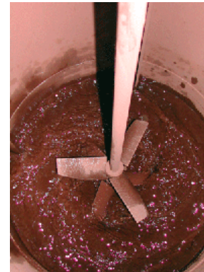
Red mud (residue from aluminium production)