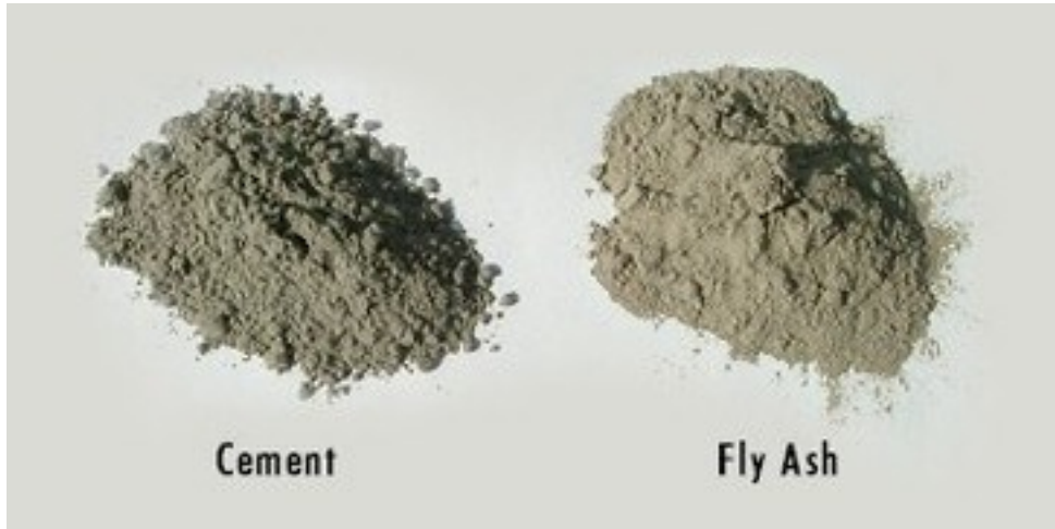
Pozzolana (pozzolanic ash)

Some of them are used as secondary raw materials in the building and construction industry.